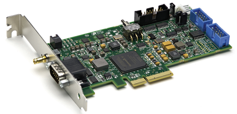
BitFlow > Frame Grabbers > Aon-CXP

The Aon-CXP is the simplest and most affordable CoaXPress frame grabber that can be manufactured, yet it is still incredibly powerful and flexible