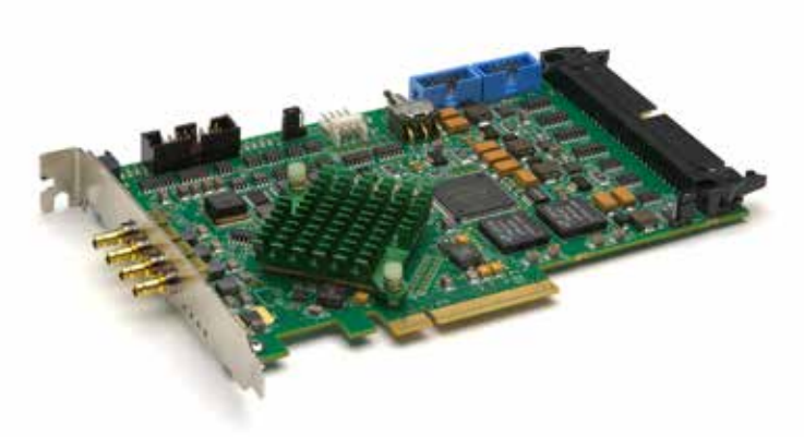
BitFlow > Frame Grabbers > Cyton-CXP4

With the Cyton, BitFlow doubles the speed of its frame grabbers by moving to PCIe Gen 2.0 Further efficiencies are achieved with a brand new DMA engine.